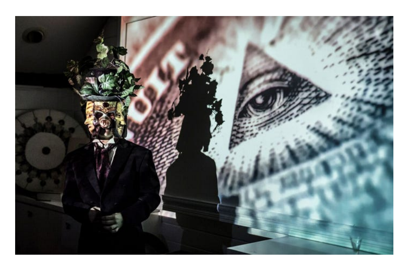
Explaining the Satanic Illuminati All-Seeing Eye in the pyramid, all part of the Satanic New World Order